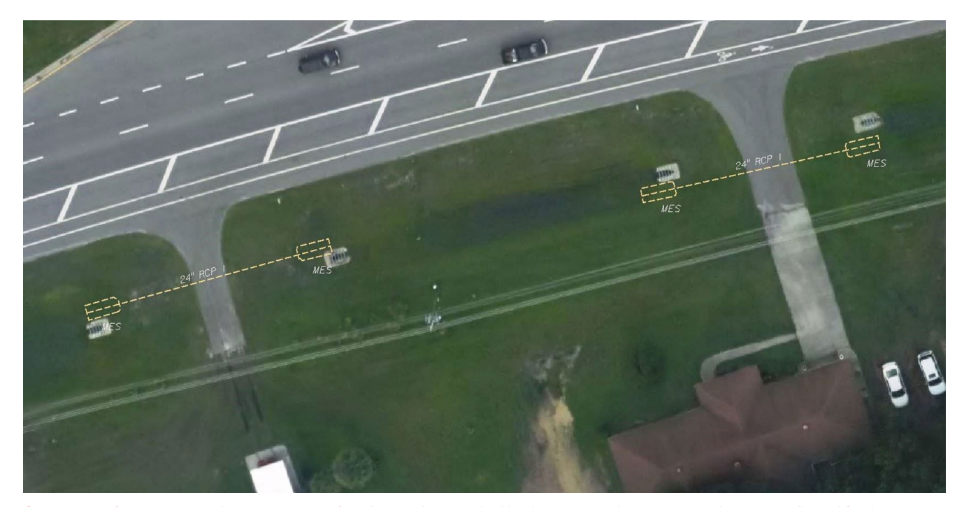
Comparison of existing storm drainage mapping from legacy data supplied by the owner to the current aerial imagery collected for the project.

yet reexamining the approach resulted in these lessons learned: