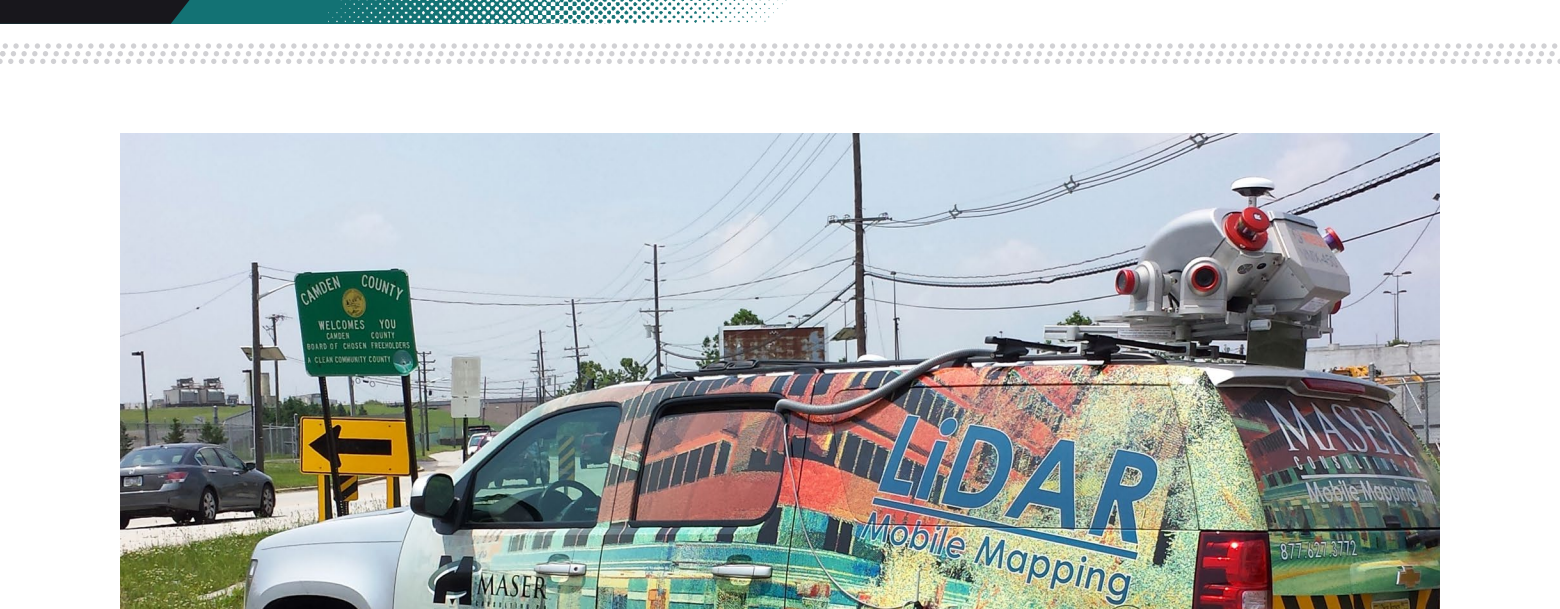
Maser Consulting P.A.'s mobile LiDAR vehicle